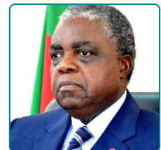
René Sadi Minister of Communications, Cameroon